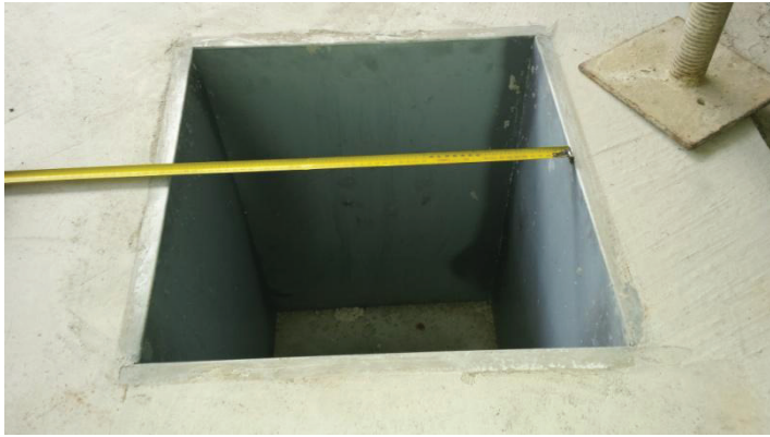
Figure 1 - Shroud set in the slab