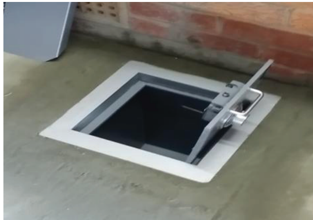
Figure 3 - Final Concrete Encasement